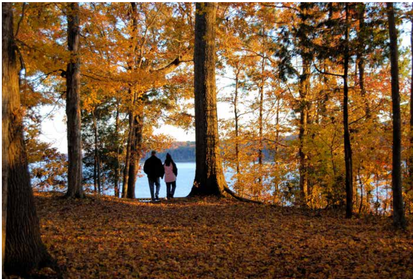
Fall walk | Virginia Department of Conservation and Recreation