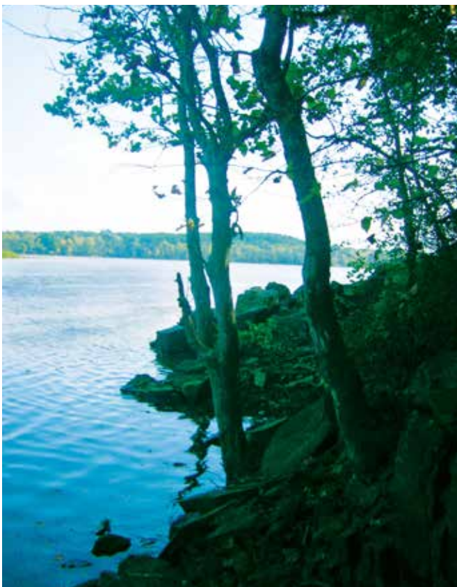
The water | Virginia Department of Conservation and Recreation

Source: 2017 Virginia Outdoors Demand Survey. Visit www.dcr.virginia.gov/vop to view regional participation rates for more than 100 activities.