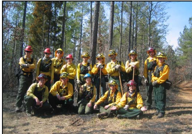
Natural Heritage and State Park crew joined by TNC and Americorps volunteers at Difficult Creek Natural Area Preserve restoring habitat for the federally endangered smooth coneflower.