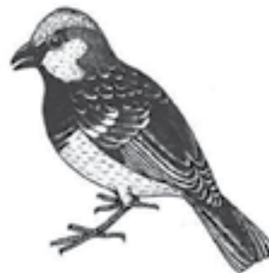
Male House Sparrow