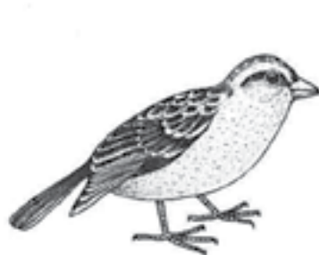
Female House Sparrow