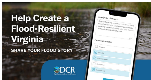
Caption: Help shape Virginia's flood response by sharing your personal experiences. Your story can help others understand and prepare for similar situations. Visit the Flood Story Web App to contribute and let's work together to create a flood-resilient Virginia. dcr.virginia.gov/FloodStory