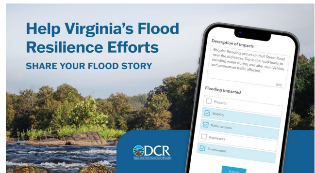
Header: Share Your Flood Story

Body Text: It takes the whole community to collaboratively plan and implement solutions in response to the challenges of flooding. Sharing your flood story enables Virginia's leaders to better anticipate, prepare for, respond to, and recover from floods. These stories aid in crafting effective flood prevention strategies and help inform the Flood Resilience Master Plans created by DCR. Stories can also be provided to other flood resilience practitioners to help shape flood management efforts across the state. Visit the Department of Conservation and Recreation's Flood Story Web App to help create a flood-resilient Virginia.