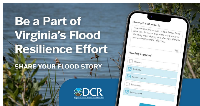
Caption: Make an impact with your flood experiences. By sharing your story, you're playing a crucial role in helping to enhance flood safety and resilience in Virginia. Submit your story on the Flood Story Web App. dcr.virginia.gov/FloodStory