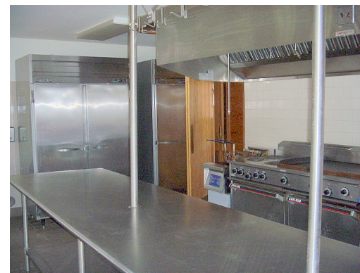
Kitchen – Swift Creek Banquet Hall. Industrial size kitchen appliances are included.