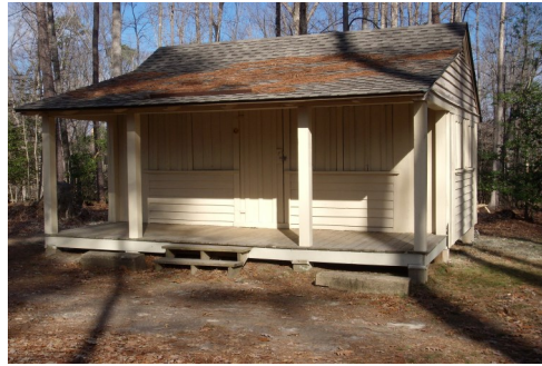
A single cabin (sleeps 4 to 8) that is within a circle, or "unit" of cabins. The circle sleeps 28 total.