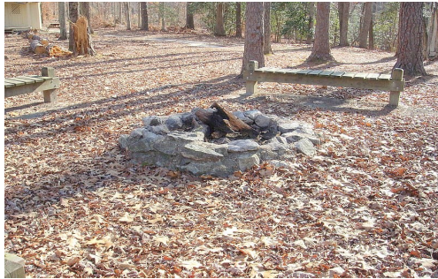
Each unit of cabins has a fire ring located in the center of the circle of cabins.