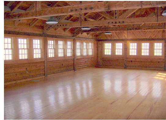
The interior (east end) of Swift Creek Banquet Hall