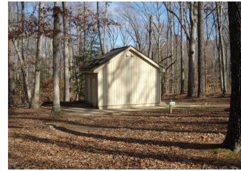
Restroom and Shower Buildings are located within the cabin unit areas.

Each Unit – Capacity 28 $175 Cabin units are rented at the Park Office or by calling 804-796-4255 (options #5) and can be rented up to eleven months in advance of the first day of the reservation. 2 night minimum stay.