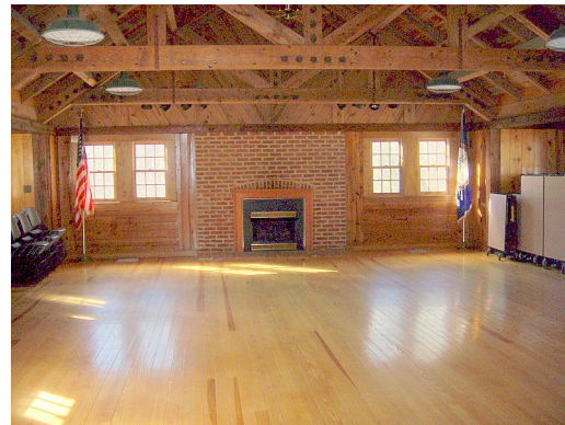
The interior (west end) of Swift Creek Banquet Hall.

The capacity of the Swift Creek Banquet Hall is 150. The capacity of the Powhatan Banquet Hall is 125.