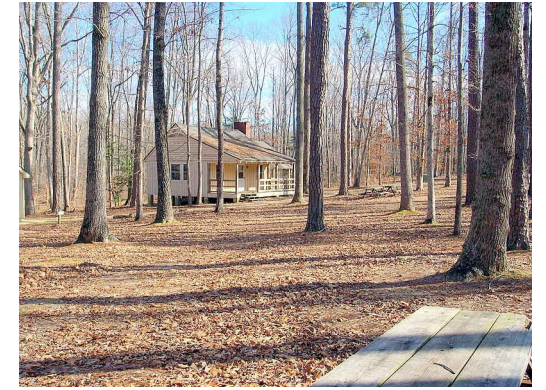
Outdoor Cabin Area – Pictured is the Lodge Building (one provided with each cabin unit).