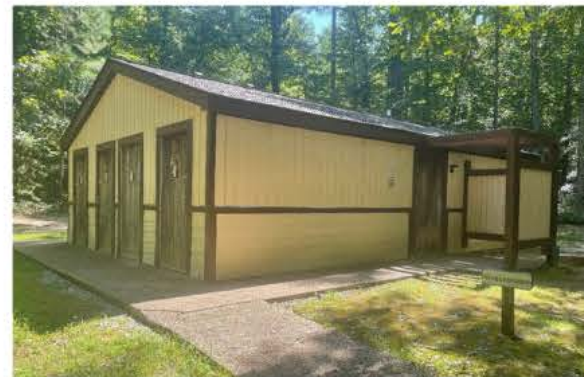
Restroom and Shower Buildings are located within the cabin unit areas.