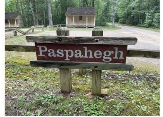
One of the six signs for Group Cabins