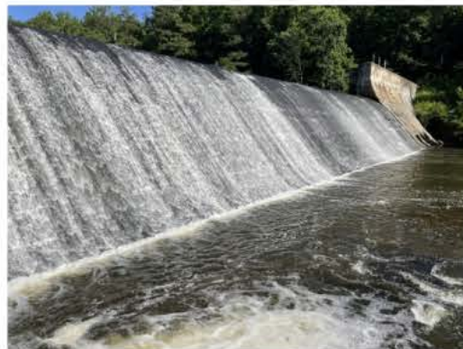
Swift Creek Dam located by 3rd Branch. Built by the CCC

The CCC Company 2386 was organized in 1935 and built what is now known as Pocahontas State Park. Thanks to our Friends of Pocahontas that conducted yearly cabin preservation. You can stay at one of the six group cabins.