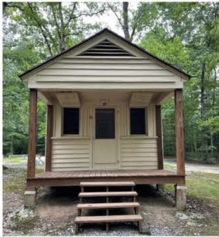
A single cabin (sleeps 4 to 6) that is within a circle, or "unit" of cabins. The circle sleeps 28 total.