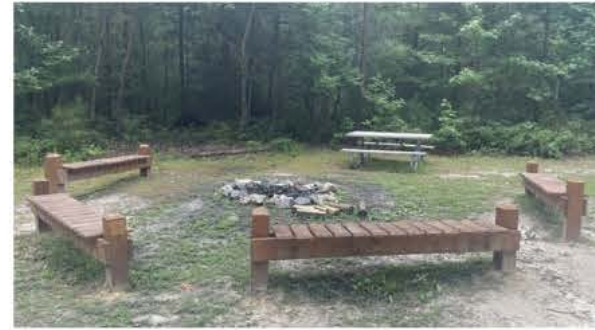
Each unit of cabins has a fire ring located in the center of the circle of cabins.