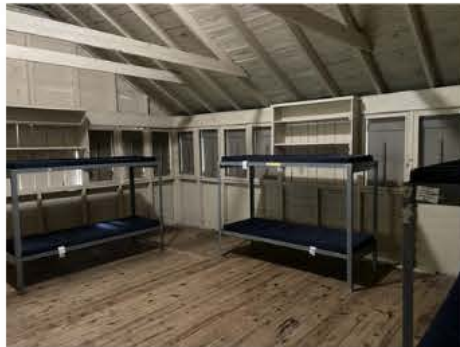
Group Cabins outside and inside