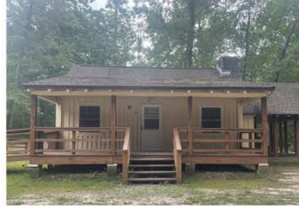
Above- Lodge Building (one provided with each cabin unit). Below- Inside of the Lodge Building